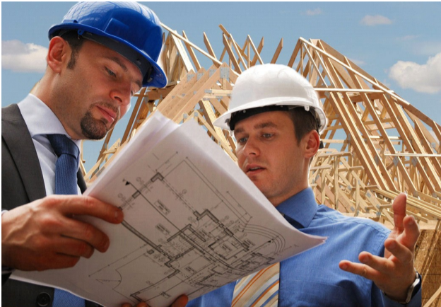
Architects, planners, builders, electricians, carpenters, etc.

Just think what the construction of the Musarium complex will do for your business.