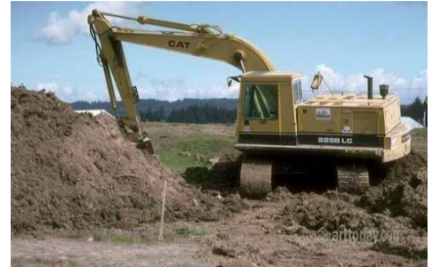
Earth moving equipment and operators.

We plan to use as much local labor and materials as possible. This is a community project.