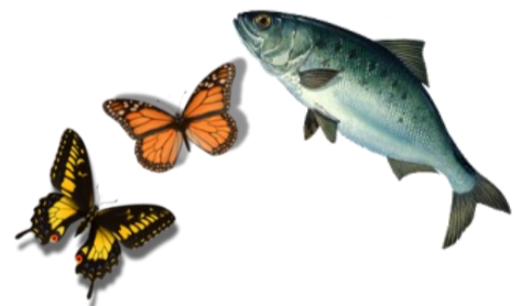
Science, biology, ecology, the environment.

Lots of things to draw and paint in the Musarium. Design notecards for our gift shop.