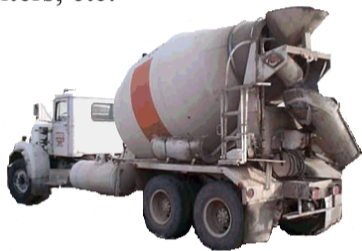
Concrete, masonry, stone work.

Materials....lumber, masonry, glass, electrical, plumbing, etc.