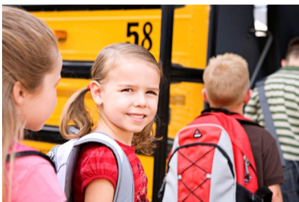
Field trips, School projects.

What the Musarium will mean for the kids....and their parents and teachers.