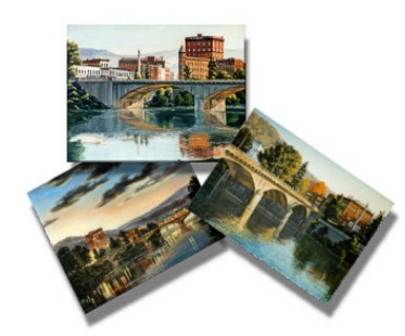
Gifts for $20 Boxed cards of 10 different scenes of the Hickory Street Bridge.***

Single scene packs of 5 cards of the newest painting, as well as packs of the previous years' paintings.***