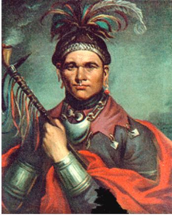
Shake hands with Cornplanter in virtual reality.

We are just one piece of the picture. We all have to work together to make this happen.