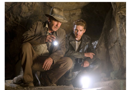
Visit the archeological dig and dig for artifacts. Great for kids and adults alike.