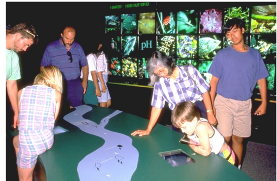
There will be hands-on learning for children and adults. Fish and wildlife is just the beginning. Experience interactive exhibits of geology, science, archeology, astronomy, conservation and the environment.