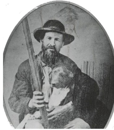
Visit an early settlement and share the routine of everyday life.