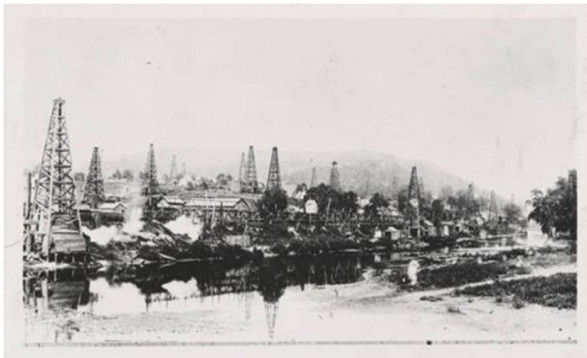
Virtual reality will provide you with the thrill of oil being struck in the 1800's.