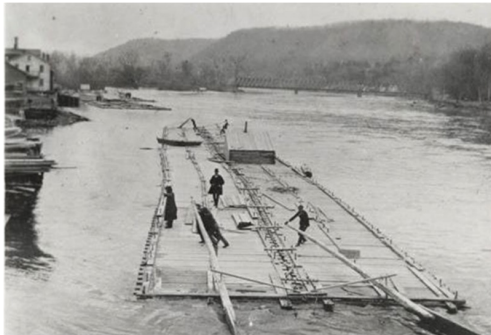
History of the timbering industry from its beginnings to the present.