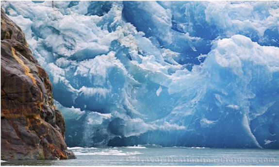
Opening Exhibit - The Glacier 900,000 BC