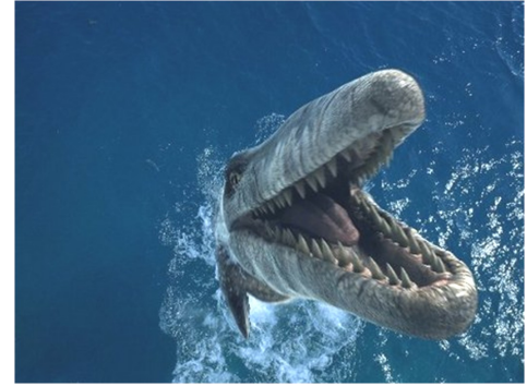
See what lived in the prehistoric lake that was here before the glacier. They'll seem alive, but are all done with robotics.