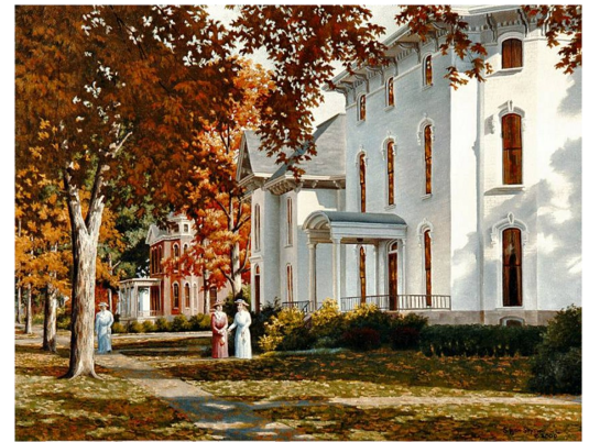
Attend a ball in a Victorian mansion, watch the dancers swirl in the candlelight.

Turn a corner and see a locomotive screaming toward you belching smoke and steam. Smell the sulfur of the burning coal. Take a tour of the inside of a train, talk to the conductor and learn the ins and outs of rail travel.