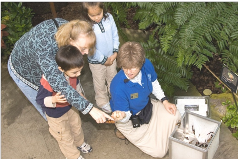
Have you ever experienced a Butterfly Pavilion?