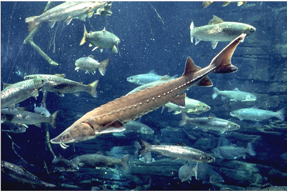
Freshwater aquarium with fish from the St. Lawrence Seaway to the Gulf of Mexico.