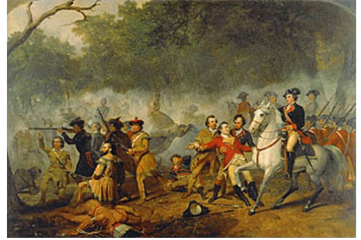
Participate with virtual reality the French and Indian Wars.