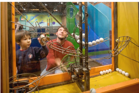
Our Discovery Center will be mainly for the children, but the adults will find it fascinating as well. Here ever-changing exhibits will entertain and educate.