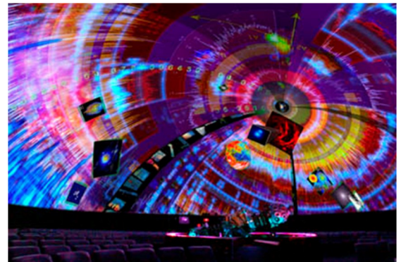
Planetarium and year-round amphitheater for the sciences and arts.